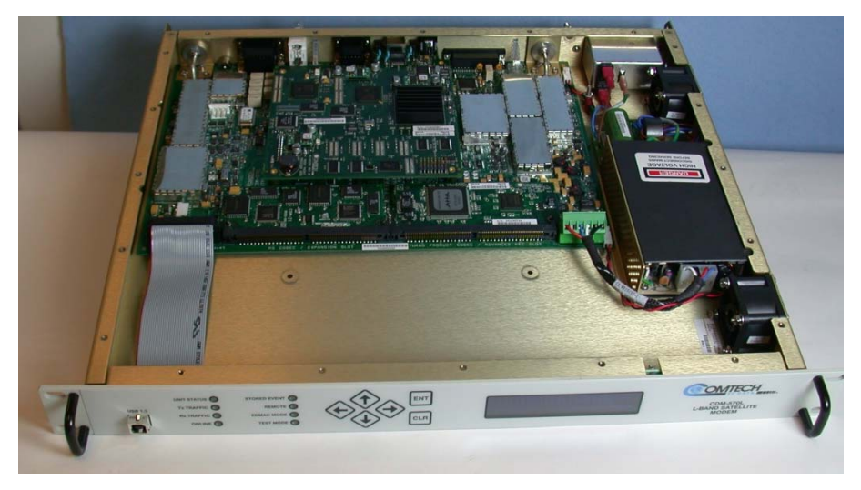
Figure 1. MPP70 correctly installed in the CDM-570L modem

CAUTION: Make sure that all of the pins are accurately aligned when you are installing the MPP70 board.