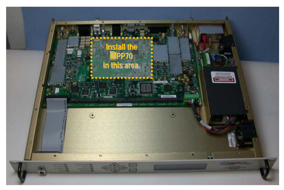
Figure 2. MPP70 properly installed in the CDM-570L modem