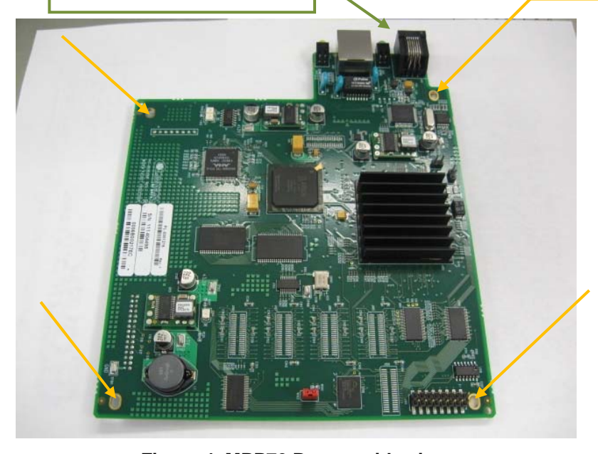
Figure 4. MPP70 Bottom side view

Install screws in four locations to secure the board.