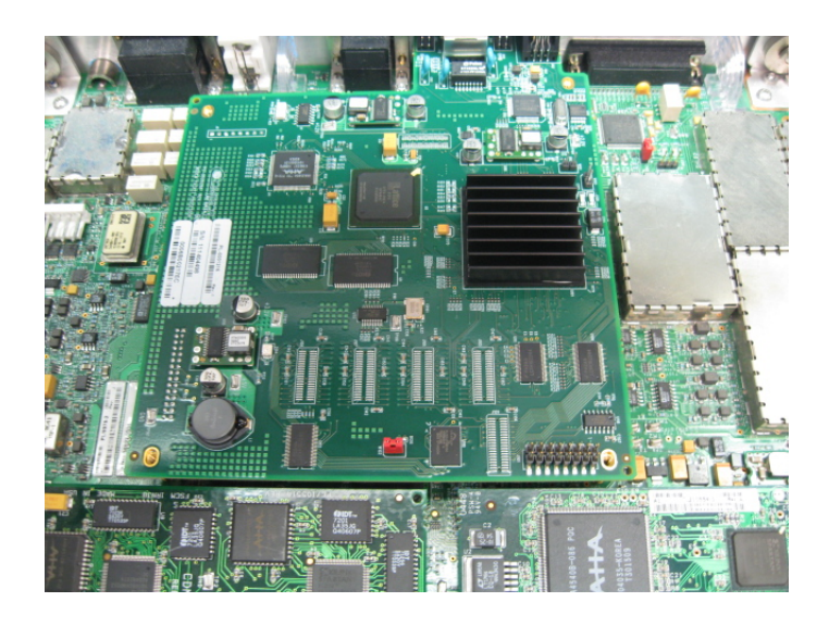
Figure 5. MPP70 board correctly installed in the CDM-570L modem